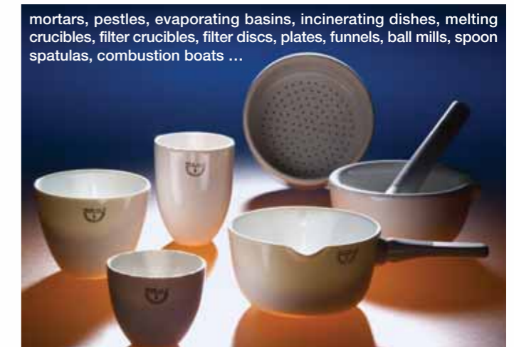
mortars, pestles, evaporating basins, incinerating dishes, melting crucibles, filter crucibles, filter discs, plates, funnels, ball mills, spoon spatulas, combustion boats ...

We have been producing and optimising our Laboratory Porcelain for more than 135 years. Our quality and our wide range of products have established our globally reputation. Our Laboratory Porcelains are in accordance with DIN VDE 0335, Type C 110. For special requirements we manufacture laboratory products such as crucibles, plates, bins, combustion boats, also from Alsint 99.7 impervious or Alsint porous.