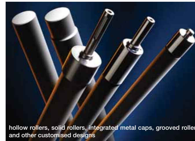
hollow rollers, solid rollers, integrated metal caps, grooved rollers and other customised designs

Outstanding mechanical features and a special surface quality make our Fused Silica Rollers indispensable as transport rollers in various glass tempering furnaces. Safety glass for architecture and the automobile industry is just one example of products refined in such furnaces. Moreover, we offer various types of Fused Silica Rollers, also with integrated metal caps. Customised designs are always possible.