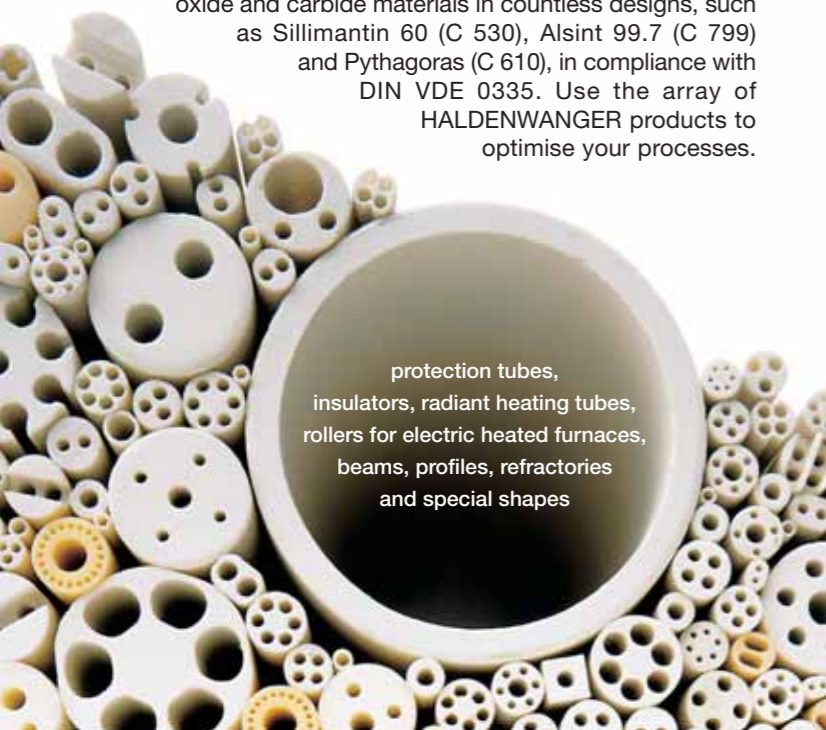
protection tubes, insulators, radiant heating tubes, rollers for electric heated furnaces, beams, profiles, refractories and special shapes

Stable processes require customised components. Our comprehensive range of Tubes delivers optimal solutions for applications up to 2000°C – in aggressive mediums as well as in alternating thermal stress loads. We offer all in all 15 oxide and carbide materials in countless designs, such as Sillimantin 60 (C 530), Alsint 99.7 (C 799) and Pythagoras (C 610), in compliance with DIN VDE 0335. Use the array of HALDENWANGER products to optimise your processes.