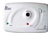
CO warning device